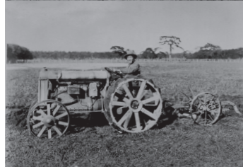
▲ Top: cows, ranch hands, and livestock barns on Oyama Farm (early Showa era). Middle: grazing sheep and Duke Matsukata's Villa on Senbonmatsu Farm (early Showa era). Bottom: a tractor on Senbonmatsu Farm (photo circa 1931).