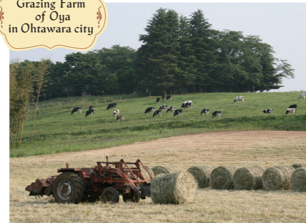
A city-run grazing farm. State-owned wildlands were developed in 1965 to create the pastures.