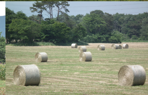
▲ Fall scenery: mowing grass