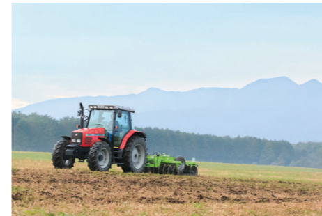
▲ Spring scenery: soil conditioning