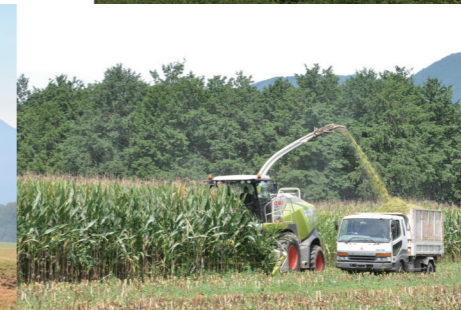
▲ Summer scenery: harvesting crops